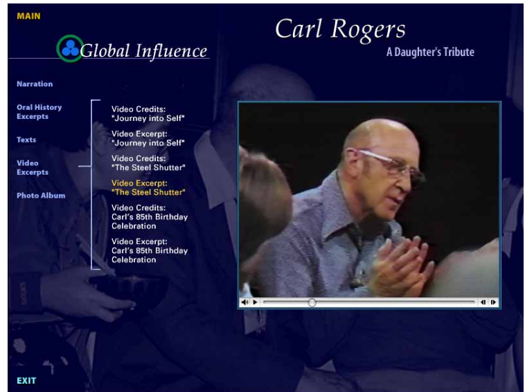
Menu screen and “Steel Shutter” video extract

His peace work is also featured, with an extract from “The Steel Shutter” – a group he facilitated on the Northern Ireland conflict.