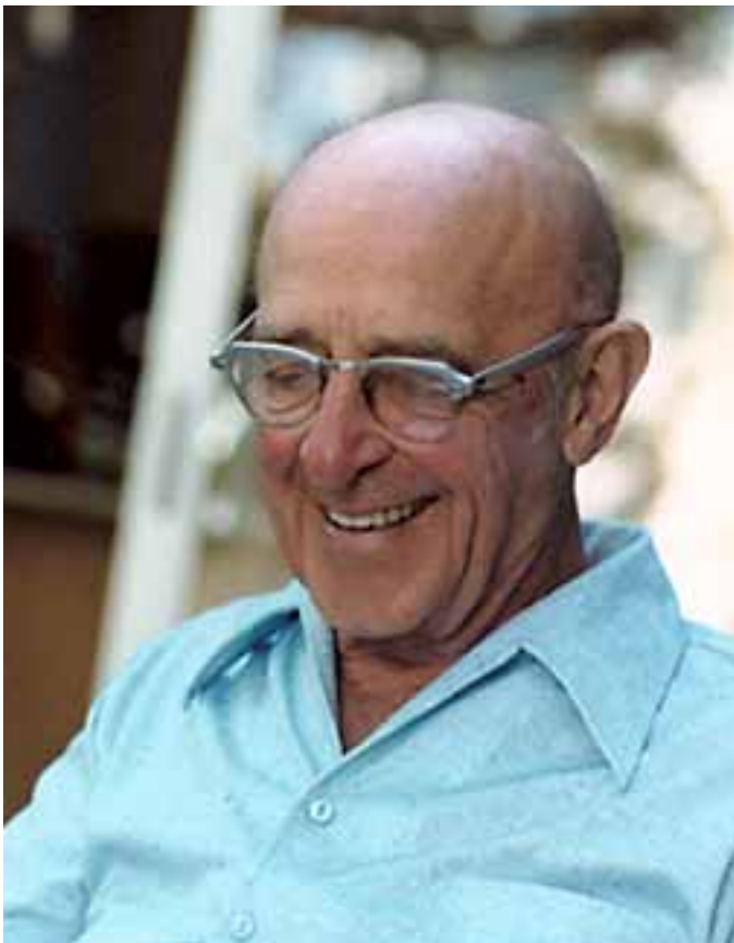
early 1980’s still photograph

For all other orders, go to Mindgarden Media’s website: www.mindgardenmedia.com .