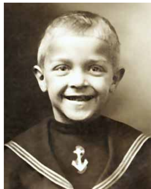
early 1980's still photograph

many interesting contributions from his family, such as "A Wife's Eye View of Carl Rogers" by Helen. All the texts are in .pdf format and are accessed via Adobe Acrobat Reader, which is included on the disc. Carl's work, excerpts from letters, notes and his diary from his trip to China are also included.